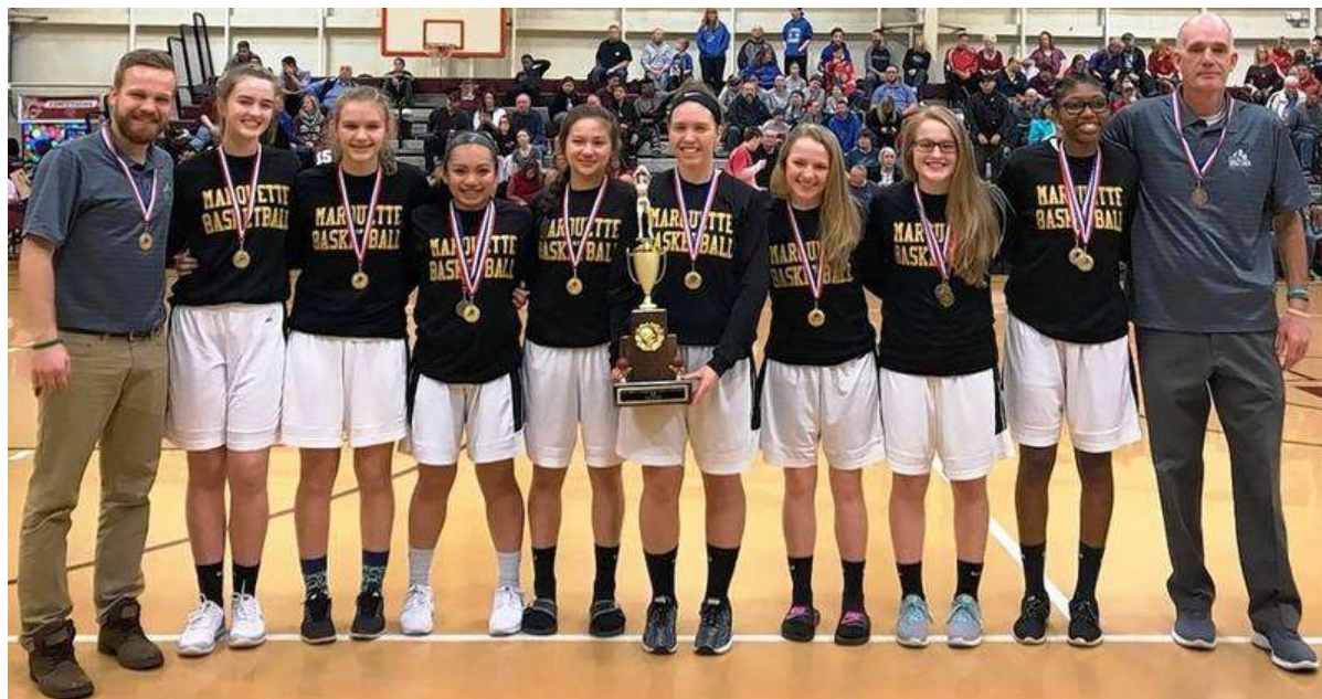
Marquette Manor Baptist Academy players and coaches celebrate after the team won the Illinois Association of Christian Schools state championship in Rockford on Saturday.